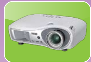
Epson PowerLite 400W Projector

For over 25 years eInstruction has teamed up with educators across the country, developing technology and content solutions to improve the learning experience. Our products and services use innovative technology to give teachers the tools they need to maximize classroom learning. By connecting teachers with students, eInstruction is changing the face of education.