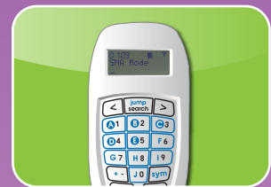
CPS RF Clicker